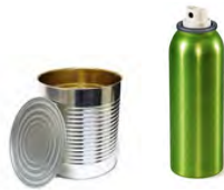
STEEL CANS & AEROSOLS

EMPTY ITEMS AND FLATTEN CARDBOARD BEFORE PLACING IN BIN