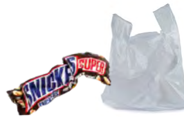
SOFT 'SCRUNCHABLE' PLASTIC