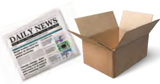
CLEAN PAPER & CARDBOARD