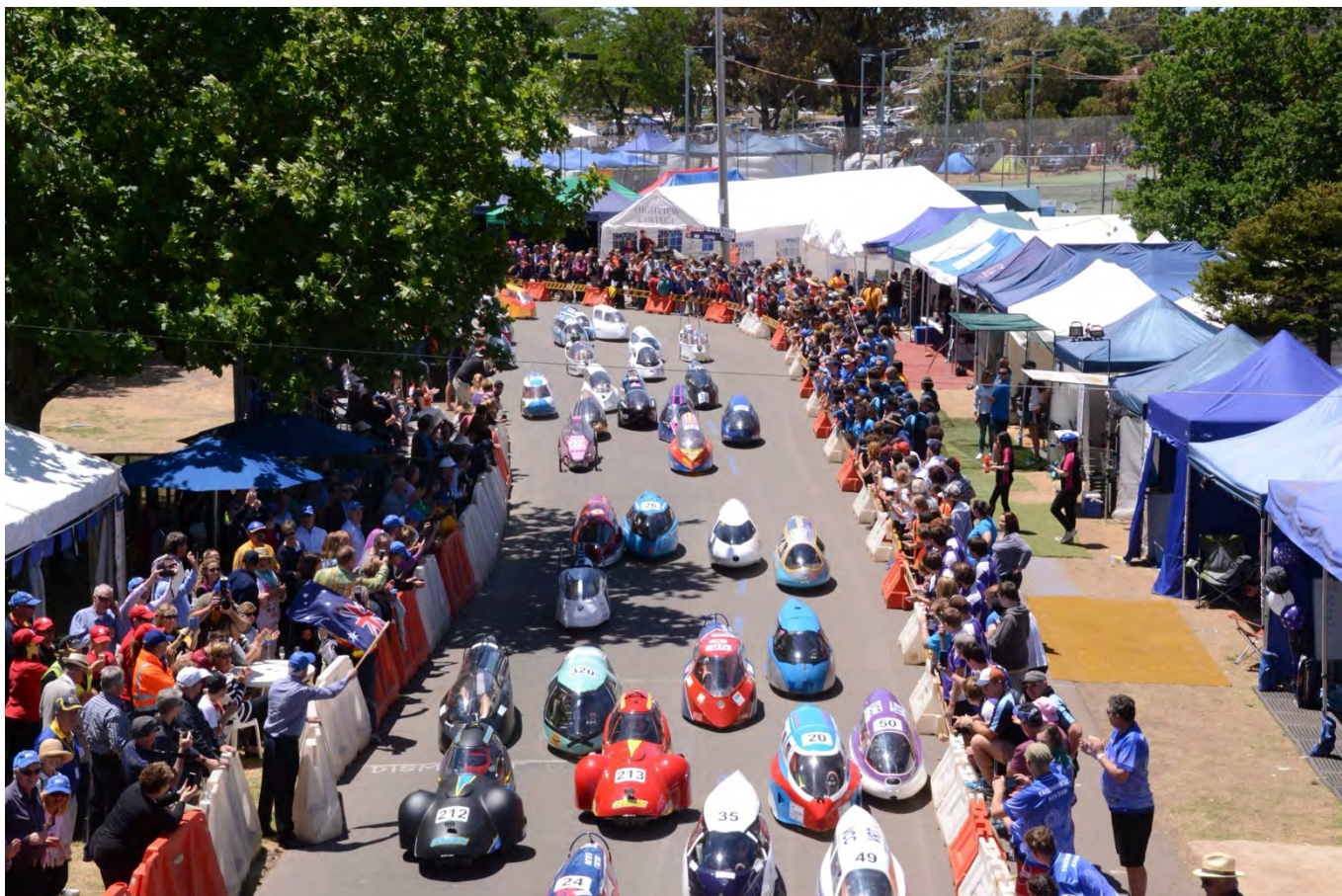
Above: The start of the 24 Hour HPV Secondary and Energy Efficient Vehicle Trial.

Each category has a specific 'Handbook' that covers the vehicle, cart or creations specification and Trials details.