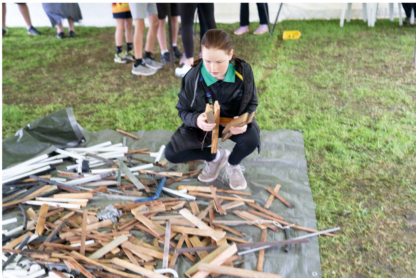
Above: A student collects materials during 'The Junkyard Challenge'.

More details are available in the specific handbook for this category.